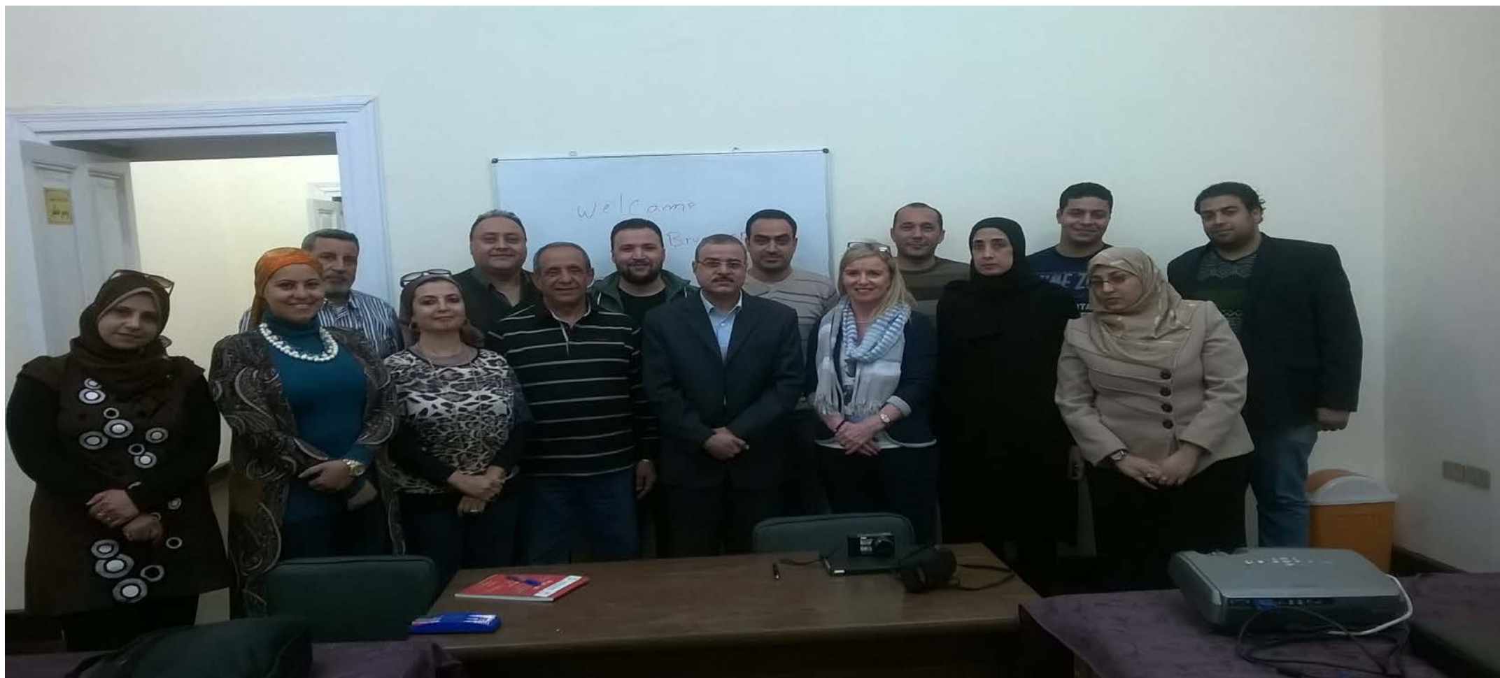
EU-Tempus Programme – “IP- MED” Project number:544429-TEMPUS-I-2013-I-PS-TEMPUS-JPCR