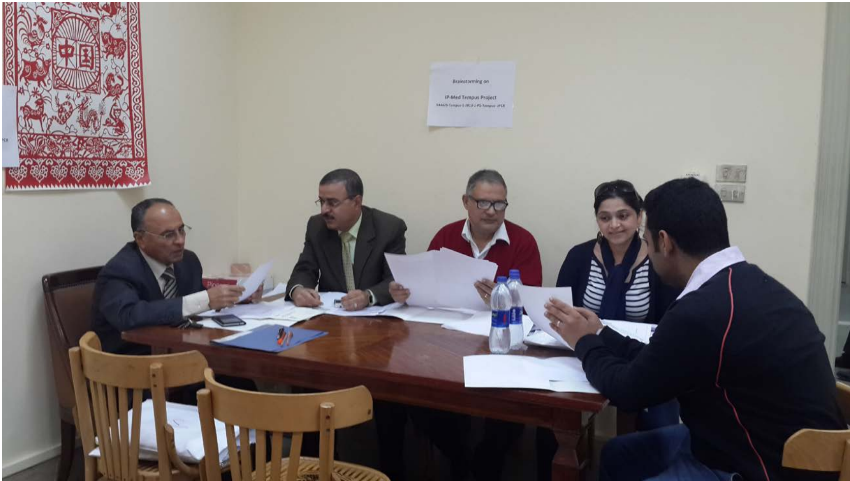
EU-Tempus Programme – “IP- MED” Project number:544429-TEMPUS-I-2013-I-PS-TEMPUS-JPCR