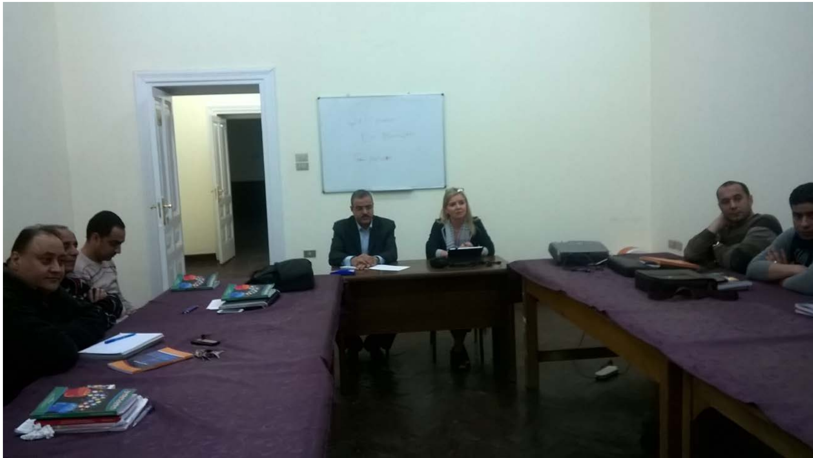
EU-Tempus Programme – “IP- MED” Project number:544429-TEMPUS-I-2013-I-PS-TEMPUS-JPCR