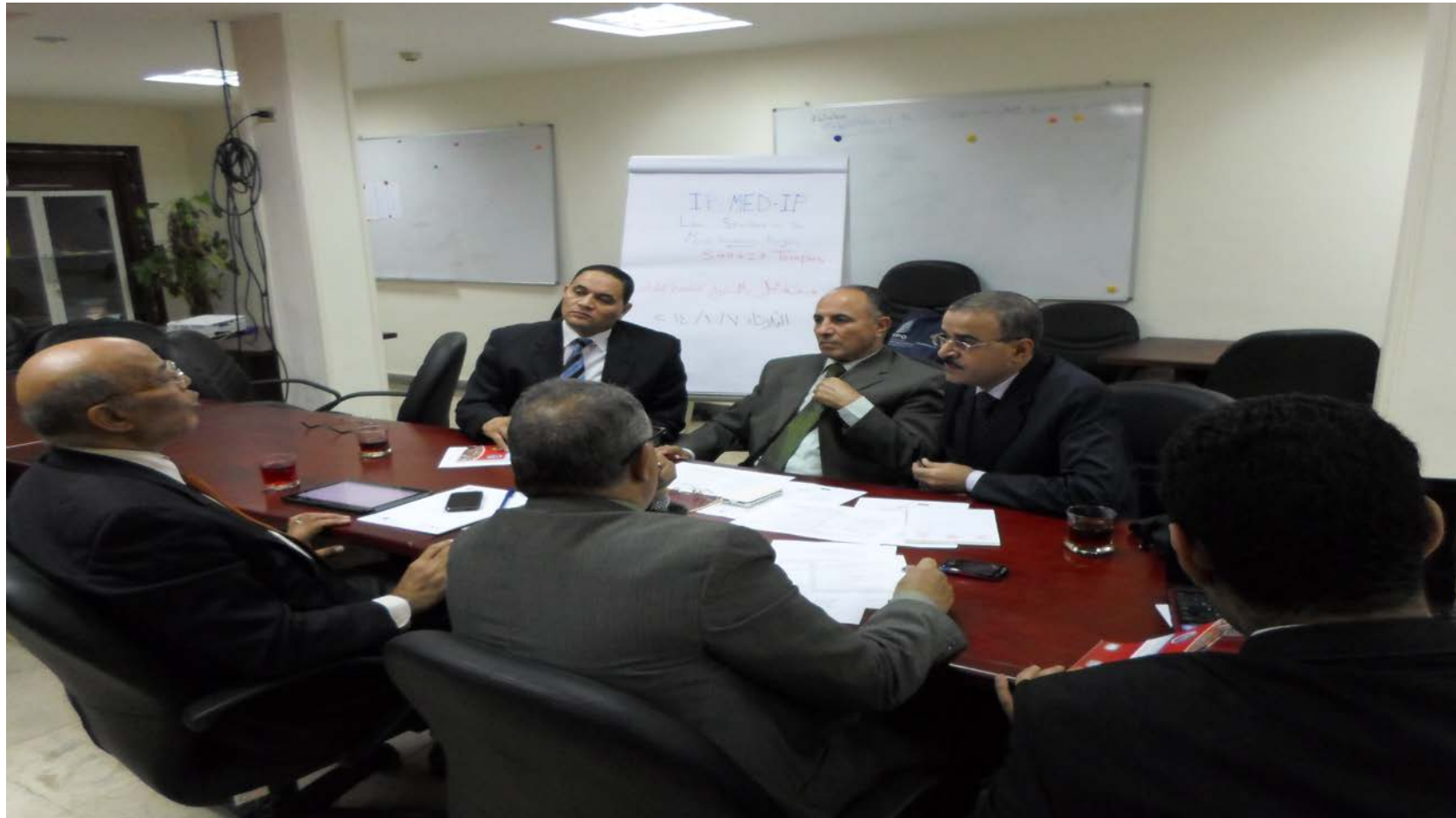
EU-Tempus Programme – “IP- MED” Project number:544429-TEMPUS-I-2013-I-PS-TEMPUS-JPCR